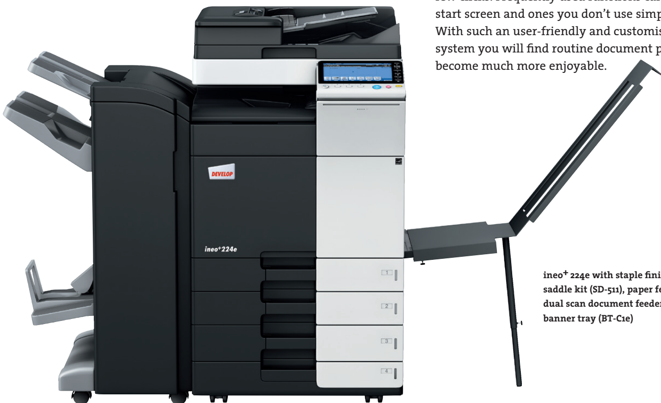
ineo+ 224e with staple finisher (FS-534), saddle kit (SD-511), paper feeder (PC-210), dual scan document feeder (DF-701), banner tray (BT-C1e)

Many multifunctional office systems are anything but user-friendly. The ineo+ 224e, in contrast, is simplicity itself. An intuitive, easily understandable operating concept ensures that it is as easy to use as your smartphone or tablet. The 9-inch capacitive touchscreen comes with familiar multi-touch operations such as flick, drag&drop and pinch in&out – so you will feel at home in this system in no time at all. Thanks to a new menu navigation structure you can see all functions in one go and select the settings you want with just a few clicks. Frequently used functions can be left on the start screen and ones you don't use simply removed. With such a user-friendly and customisable office system you will find routine document production jobs become much more enjoyable.