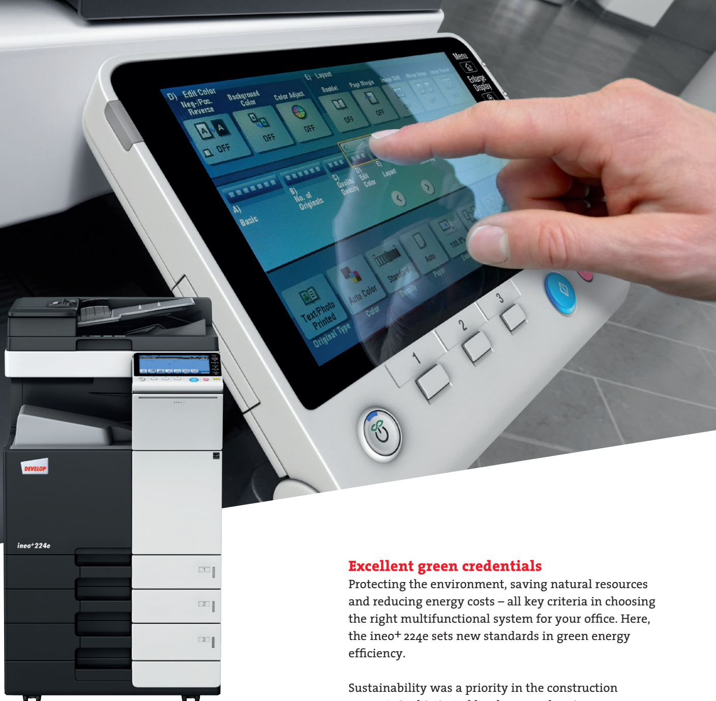
ineo + 224e with paper feeder (PC-210) and dual scan document feeder (DF-701)