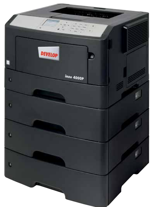
ineo 4000P with three additional paper cassettes (PF-P12)

If the operating system on your current printer is frustratingly difficult to follow and the device difficult to use, it is time you considered switching to an ineo 4000P. Its 2.4-inch colour display ensures intuitive operability and highlighted menus show users the system's status, operating options and settings. What's more, a folder-like navigation concept means the ineo 4000P is easier to use than many older systems. This saves your staff time and effort in everyday printing jobs. And nobody will have to consult an operating manual before using this new printer.