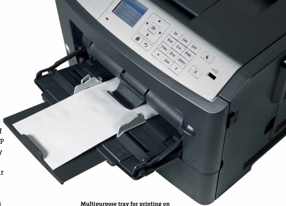
Multipurpose tray for printing on special media such as envelopes

Are high-volume print jobs commonplace in your business? With a maximum capacity of 2,000 sheets you can be sure that the ineo 4000P will not run out of paper. And if you frequently print on different kinds of paper, e.g. with or without your corporate logo, you can have your ineo 4000P equipped with up to three paper trays (with 250 or 550 sheets). If the trays are stocked with different kinds, sizes and weights of paper (A6–A4 and 60–163 g/m 2 ), you ensure your staff to waste no time switching from one kind of paper to another, or running back to a printer that has run out of paper.