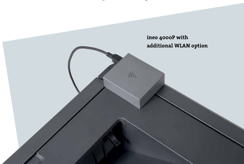
ineo 4000P with additional WLAN option