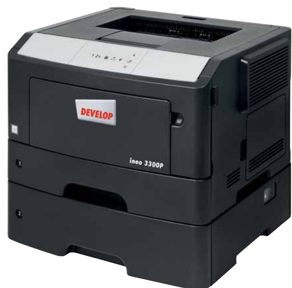
ineo 3300P with additional 550-sheet cassette (PF-P12)

If the operating system on your current printer is frustratingly difficult to follow and the device is difficult to use, it's time you considered switching to an ineo 3300P. Its ease of use will save your and your staff's time and effort in everyday printing jobs. And nobody will have to consult an operating manual before using this new printer.