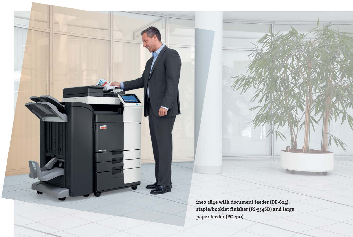
ineo 284e with document feeder (DF-624), staple/booklet finisher (FS-534SD) and large paper feeder (PC-410)

These black-and-white systems come with a number of energy-saving features that cut power consumption by over 40% compared to predecessor models. While this kind of economy saves money, other green features are ecologically beneficial. And that means DEVELOP's ineo e line-up is not only good for the environment but also boosts the owner's green credentials.