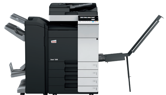
ineo+ 308 with dual scan document feeder (DF-704), staple/booklet finisher (FS-534SD), banner tray (BT-C1e) and paper feeder (PC-210)