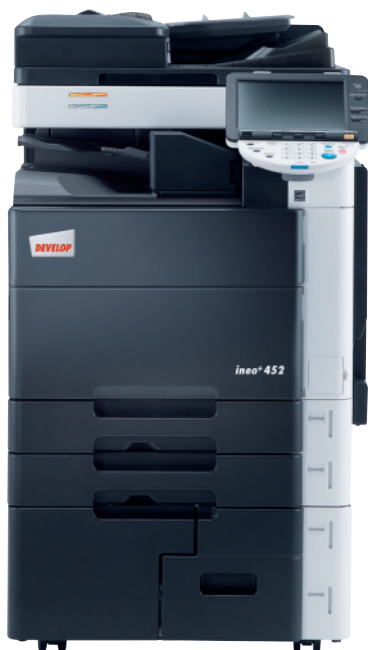
ineo+ 452 with job separator (JS-504)

One of DEVELOP's guiding principles is to show our responsibility for future generations by respecting the environment. The practical evidence is seen in the Blue Angel or Energy Star awards for devices such as the ineo+ 452. However, this system's environmental profile is exemplary in more ways than one. Production of the polymerised toner, for example, generates 40% fewer CO 2 emissions than that of conventional toner; more than 90% of DEVELOP's components can be recycled; and ineo systems only use electricity when they are actually operating and automatically switch off when not in use.