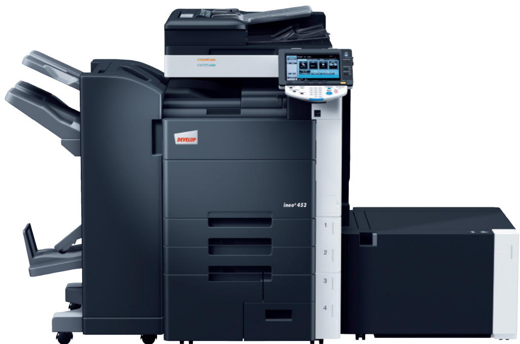
ineo+ 452 with staple finisher (FS-527), saddle kit (SD-509), and large capacity tray (LU-204)