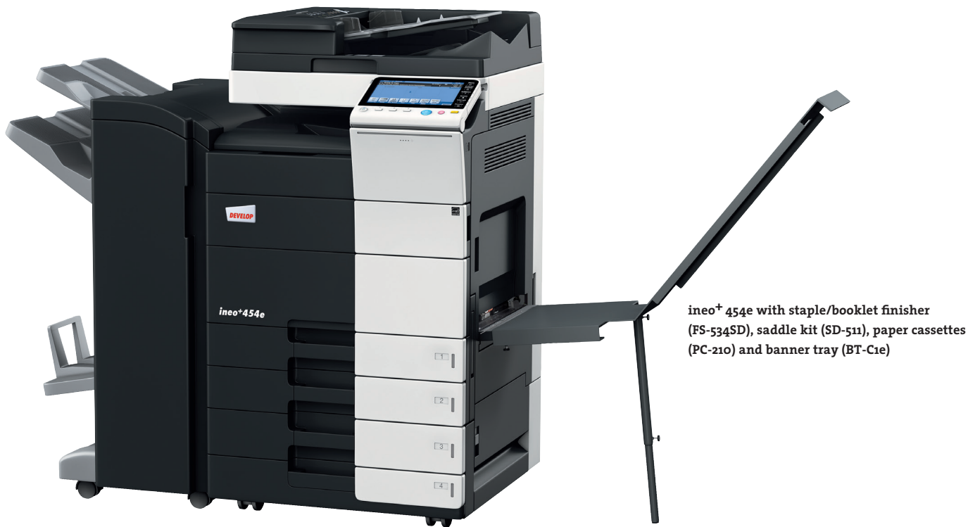
ineo+ 454e with staple/booklet finisher (FS-534SD), saddle kit (SD-511), paper cassettes (PC-210) and banner tray (BT-C1e)