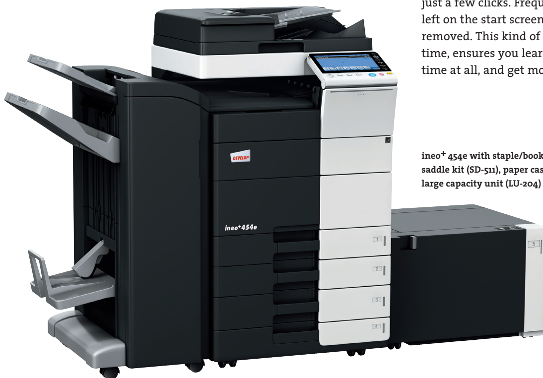
ineo+ 454e with staple/booklet finisher (FS-534SD), saddle kit (SD-511), paper cassettes (PC-210) and large capacity unit (LU-204)

Many multifunctional office systems are anything but user-friendly. The ineo+ 454e, in contrast, is simplicity itself. An intuitive, easily understandable operating concept ensures that it is as easy to use as your smartphone or tablet. The 9-inch capacitive touchscreen comes with well-known multi-touch operations such as flick, drag&drop or pinch in&out. Thanks to a new menu navigation structure you can also see all functions in one go and select the settings you want with just a few clicks. Frequently used functions can be left on the start screen and ones you don't use simply removed. This kind of customisation saves you lots of time, ensures you learn to operate the system in no time at all, and get more fun out of routine office jobs.