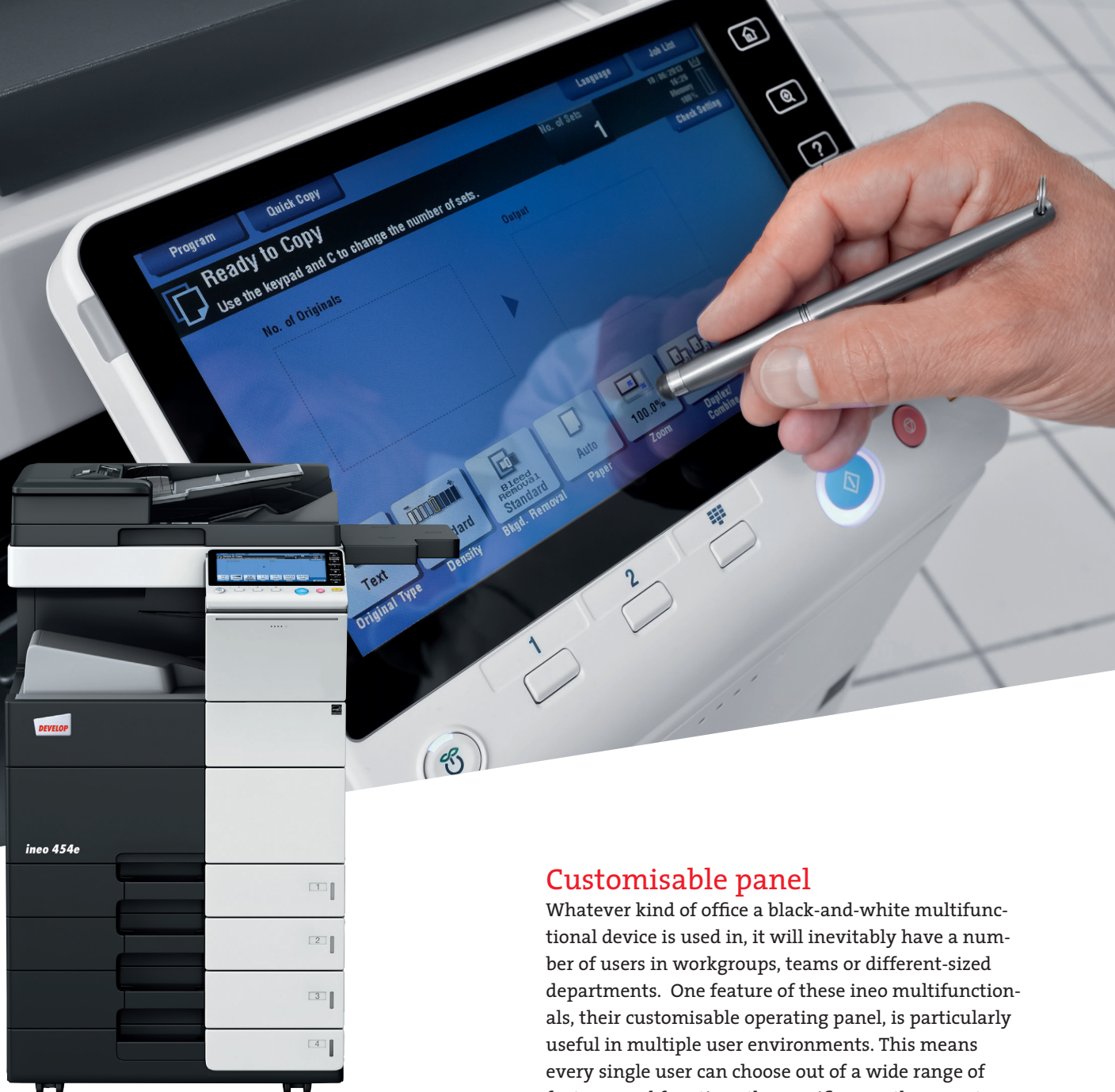
ineo 454e with paper feeder (PC-210), working table (WT-506) and output tray (OT-506)