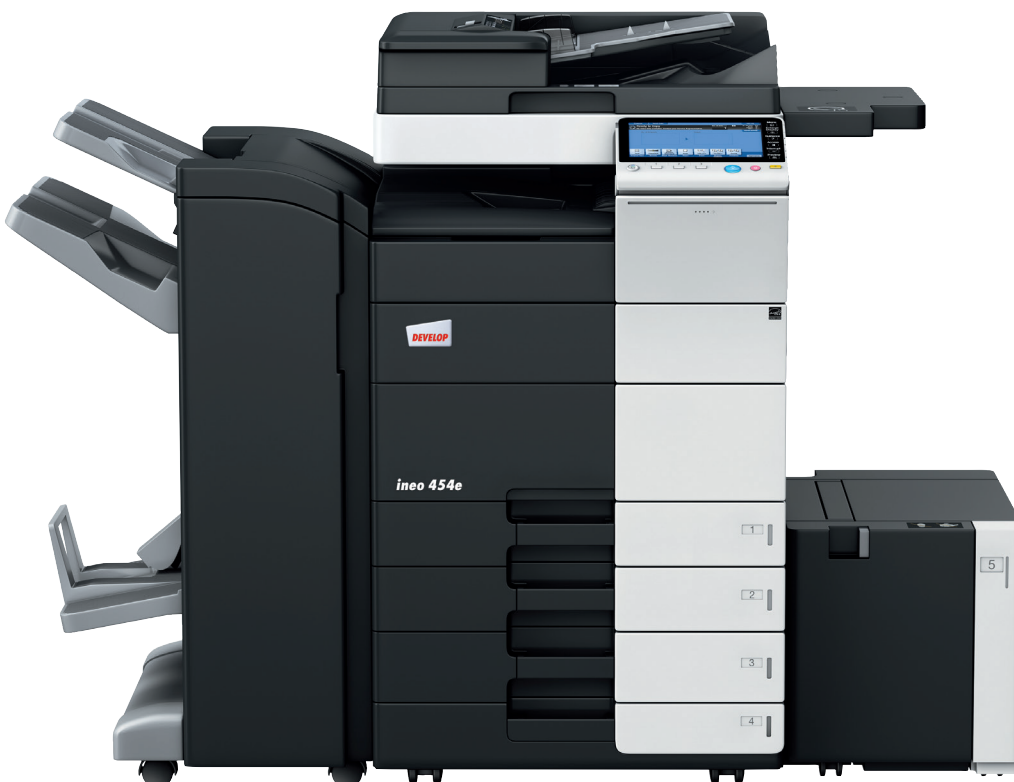
ineo 454e with staple/booklet finisher (FS-534SD), paper feeder (PC-210), large capacity tray (LU-301) and working table (WT-506)

Each of these multifunctional office devices – the ineo 224e, ineo 284e, the ineo 364e, the ineo 454e and the ineo 554e – is not only remarkably easy to use but also offers a wide variety of features to facilitate everyday office tasks. By saving office users time in printing, copying or scanning, they can return to their normal work faster. And that will ultimately help boost productivity.