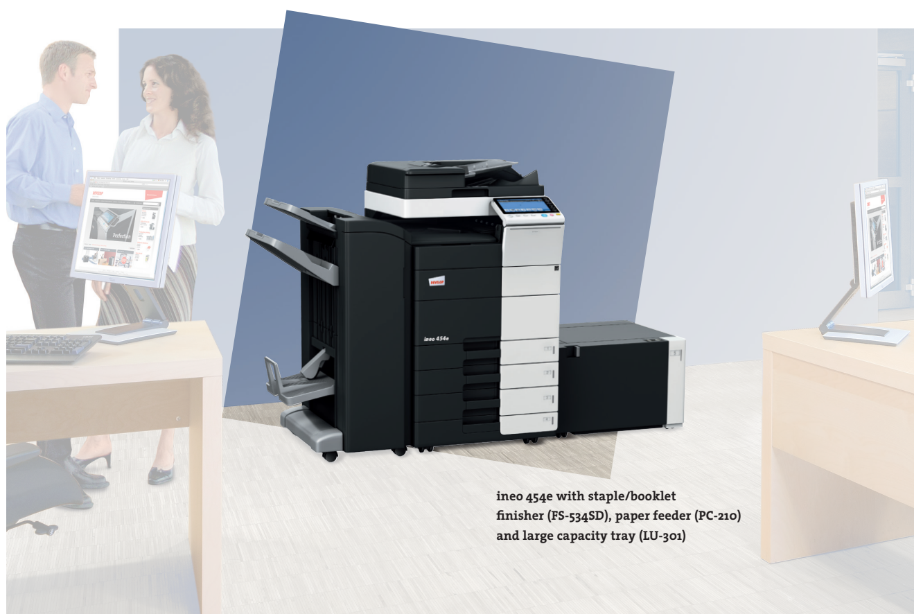
ineo 454e with staple/booklet finisher (FS-534SD), paper feeder (PC-210) and large capacity tray (LU-301)

These black-and-white systems come with a number of energy-saving features that cut power consumption by over 40% compared to predecessor models. While this kind of economy saves money, other green features are ecologically beneficial. And that means DEVELOP's ineo e line-up is not only good for the environment but also boosts the owner's green credentials.