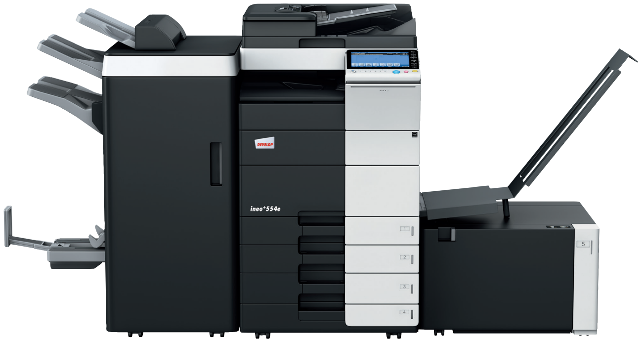
ineo+ 554e with staple finisher (FS-535), saddle kit (SD-512), job separator (JS-602), paper cassette (PC-210), large capacity unit (LU-204) and banner tray (BT-C1e)