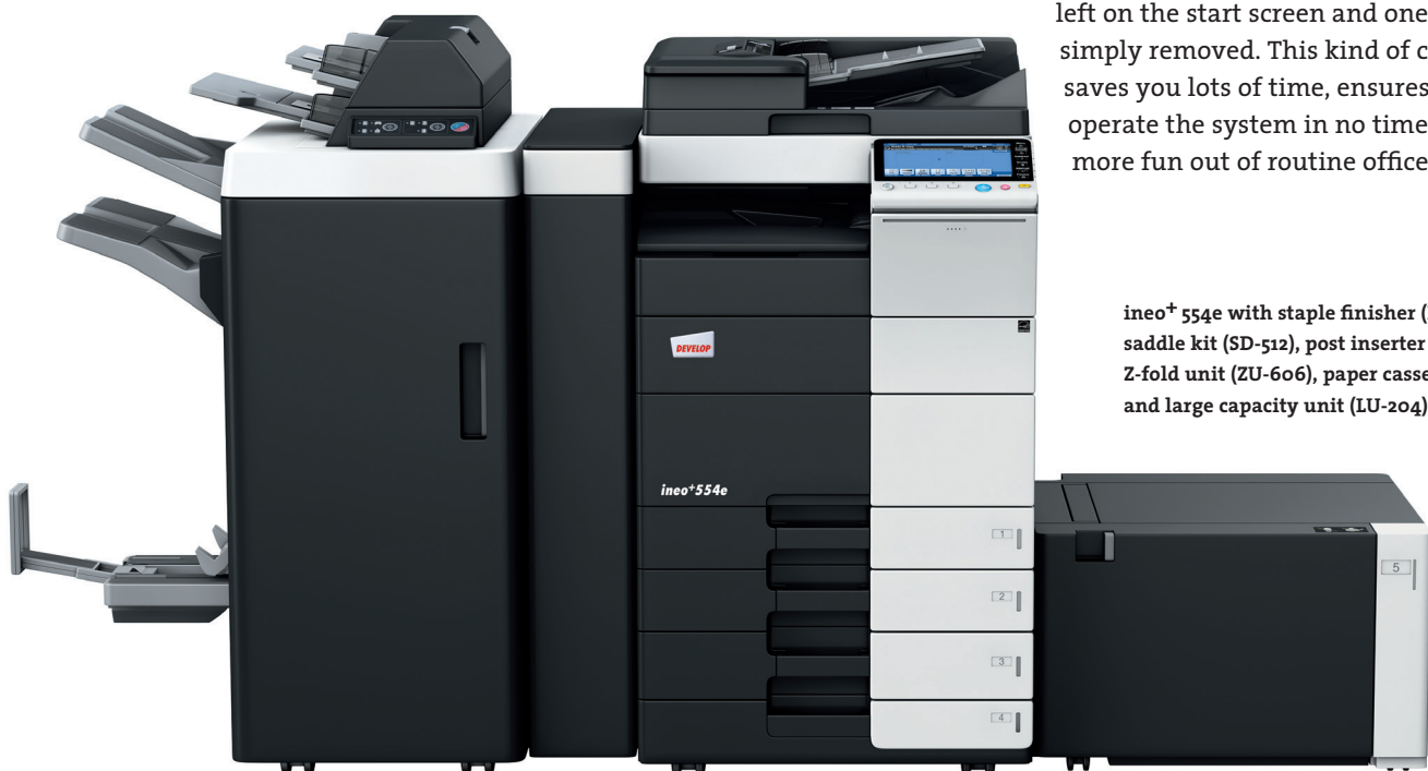
ineo+ 554e with staple finisher (FS-535), saddle kit (SD-512), post inserter (PI-505), Z-fold unit (ZU-606), paper cassettes (PC-210) and large capacity unit (LU-204)

left on the start screen and ones you don't use simply removed. This kind of customisation saves you lots of time, ensures you learn to operate the system in no time at all, and get more fun out of routine office jobs.