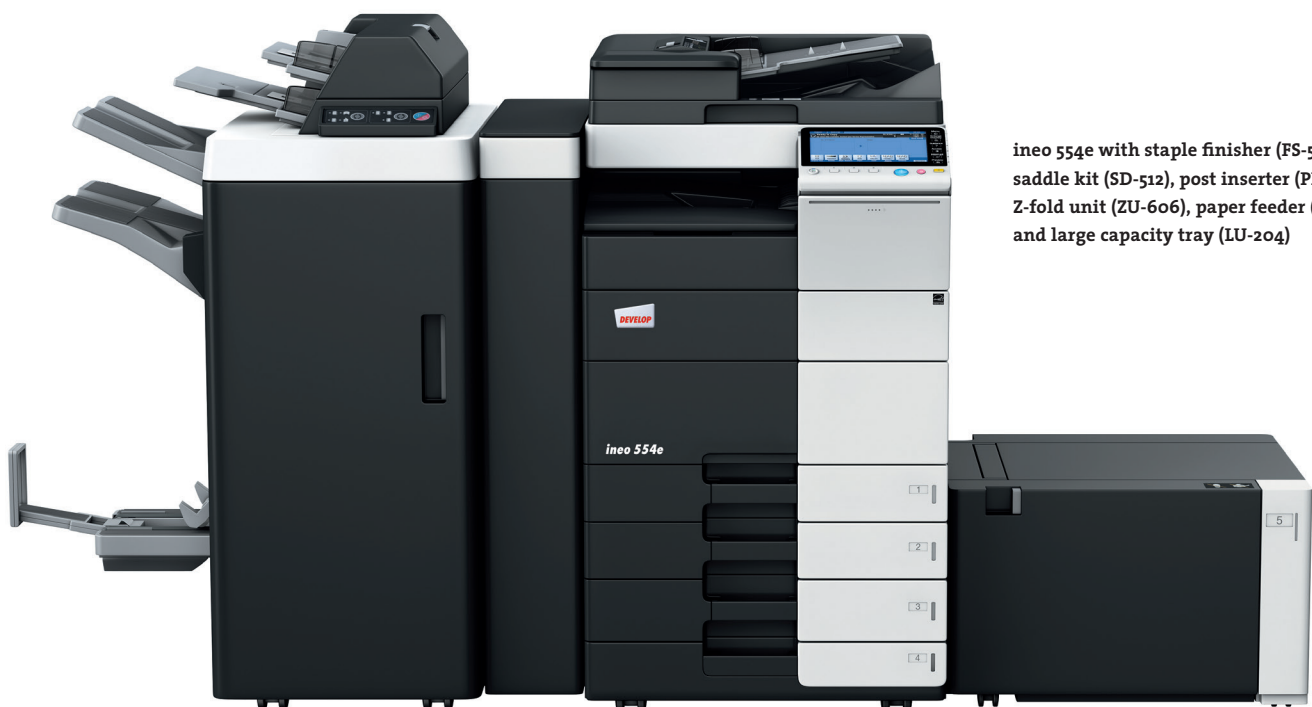
ineo 554e with staple finisher (FS-535), saddle kit (SD-512), post inserter (PI-505), Z-fold unit (ZU-606), paper feeder (PC-210) and large capacity tray (LU-204)

Each of these multifunctional office devices – the ineo 224e, ineo 284e, the ineo 364e, the ineo 454e and the ineo 554e – is not only remarkably easy to use but also offers a wide variety of features to facilitate everyday office tasks. By saving office users time in printing, copying or scanning, they can return to their normal work faster. And that will ultimately help boost productivity.