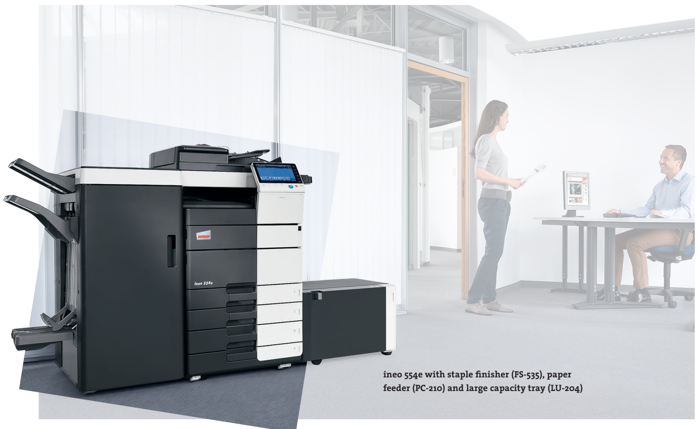
ineo 554e with staple finisher (FS-535), paper feeder (PC-210) and large capacity tray (LU-204)

These black-and-white systems come with a number of energy-saving features that cut power consumption by over 40% compared to predecessor models. While this kind of economy saves money, other green features are ecologically beneficial. And that means DEVELOP's ineo e line-up is not only good for the environment but also boosts the owner's green credentials.