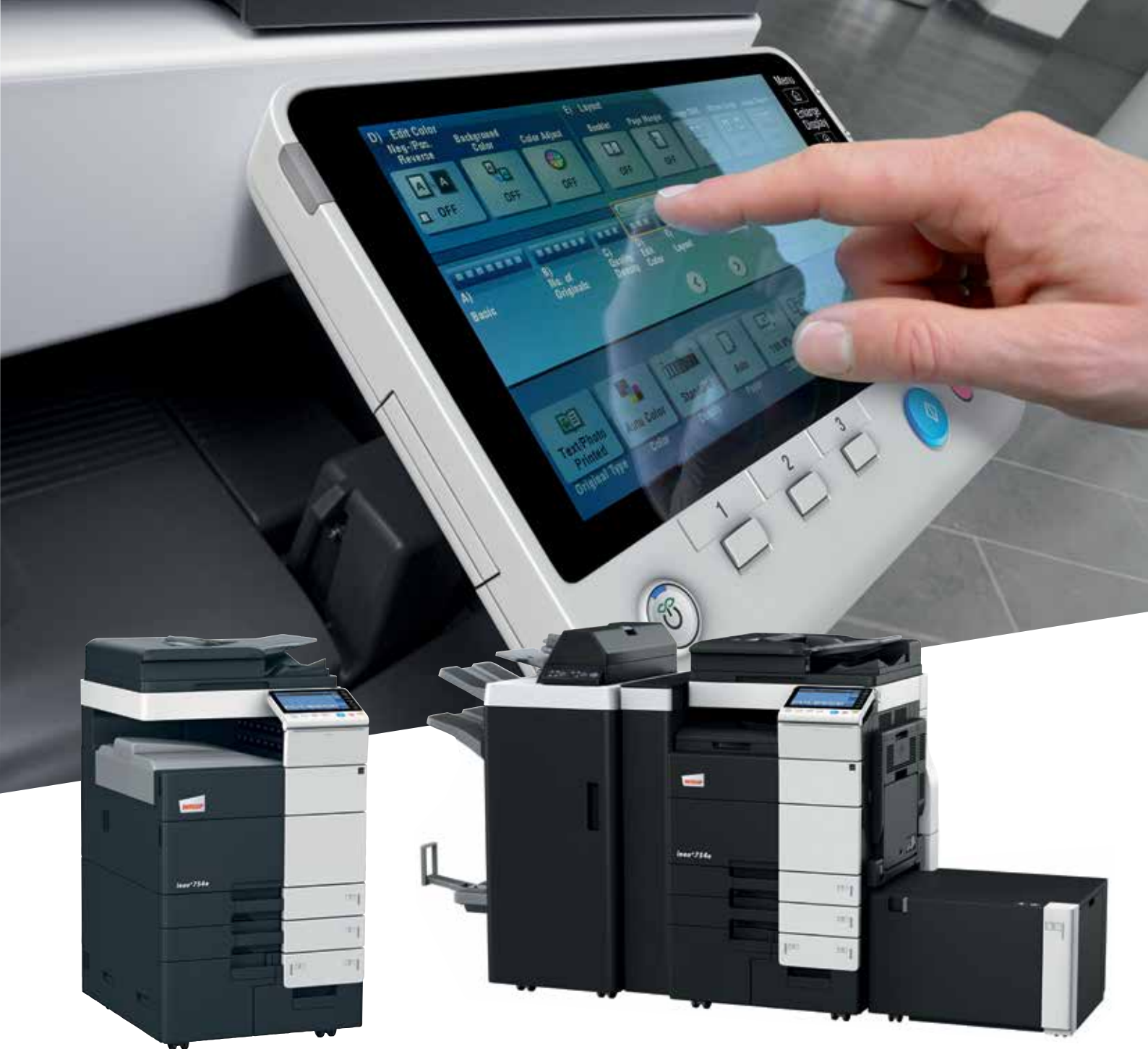
ineo+ 754e with output tray (OT-503)