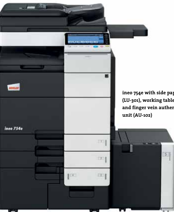
ineo 754e with side paper deck (LU-301), working table (WT-506) and finger vein authentication unit (AU-102)

The ineo 754e prints and copies at 75 A4 pages per minute (ppm). That means your staff can leave this machine to get on with any high-volume job while they carry on with their daily office work. In the multi-user environment of a departmental device or centralised office location and at an in-house printshop, this will also eliminate job queues, or at least shorten waiting times. Since this machine prints or copies in duplex mode at full speed, it will also save you money by reducing your paper consumption on high-volume jobs.