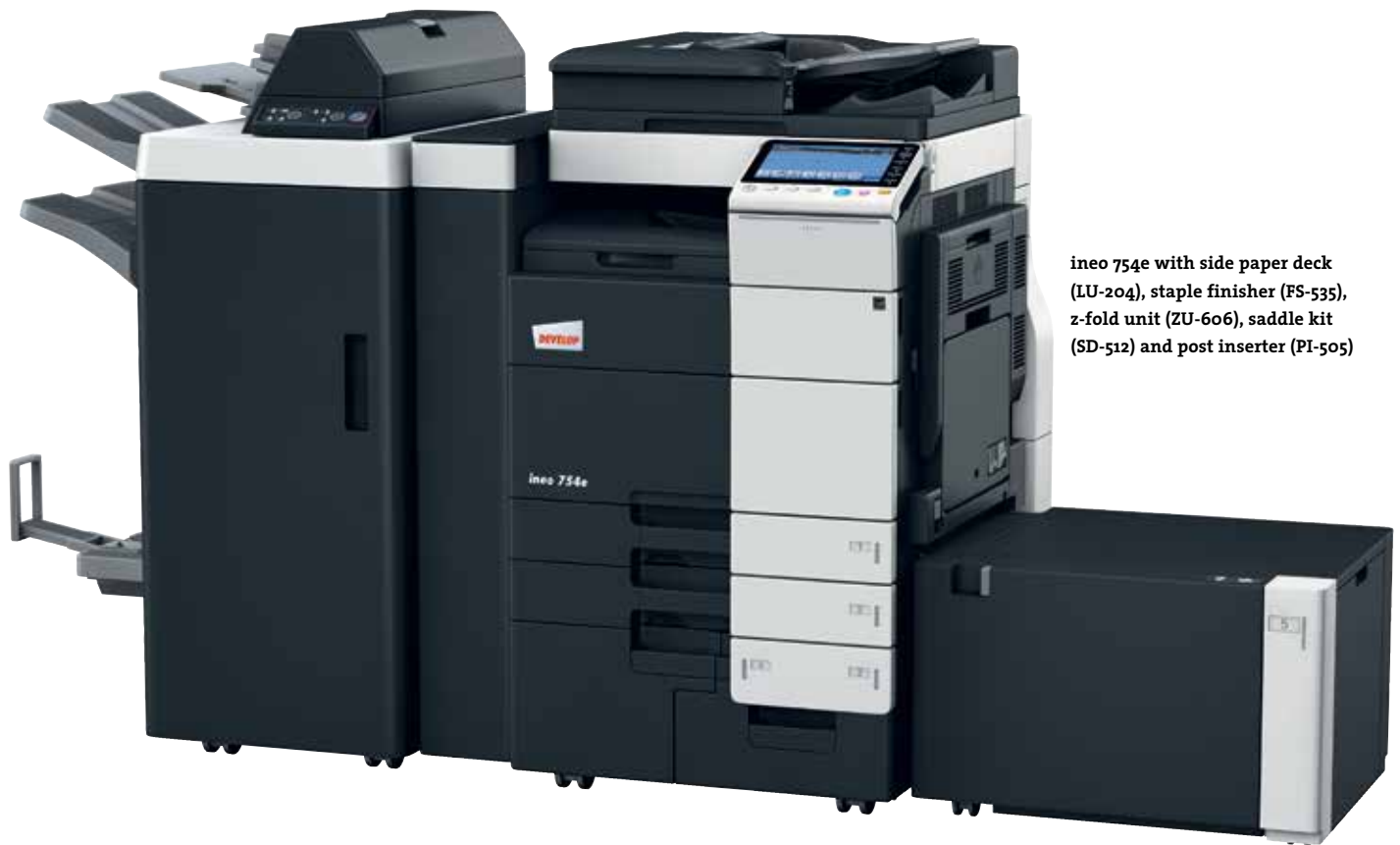
ineo 754e with side paper deck (LU-204), staple finisher (FS-535), z-fold unit (ZU-606), saddle kit (SD-512) and post inserter (PI-505)