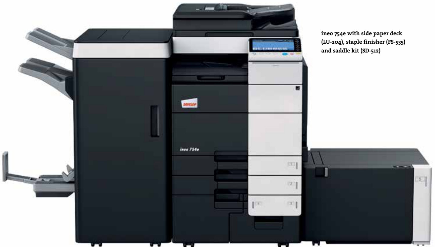
ineo 754e with side paper deck (LU-204), staple finisher (FS-535) and saddle kit (SD-512)

Viruses, Trojan horses, hacker attacks: these days, no business can afford to ignore the challenging issue of IT security. That's why the ineo 754e is certified to ISO 15408 EAL 3, the industry's security standard for multifunctional systems. What's more, it also comes equipped with numerous data-security features such as IPsec encryption, which ensures secure communication channels for all documents passing through your company's network. There is no danger of confidential documents or data getting into the wrong hands either since access to the system can be restricted to authorised users by means of the standard hard-disk encryption kit and authentication technology. This way, we ensure your sensitive data stay secure – now and in future.